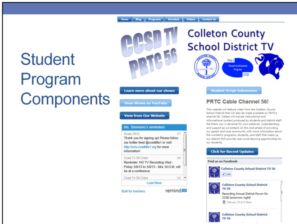
Website developed January 2013